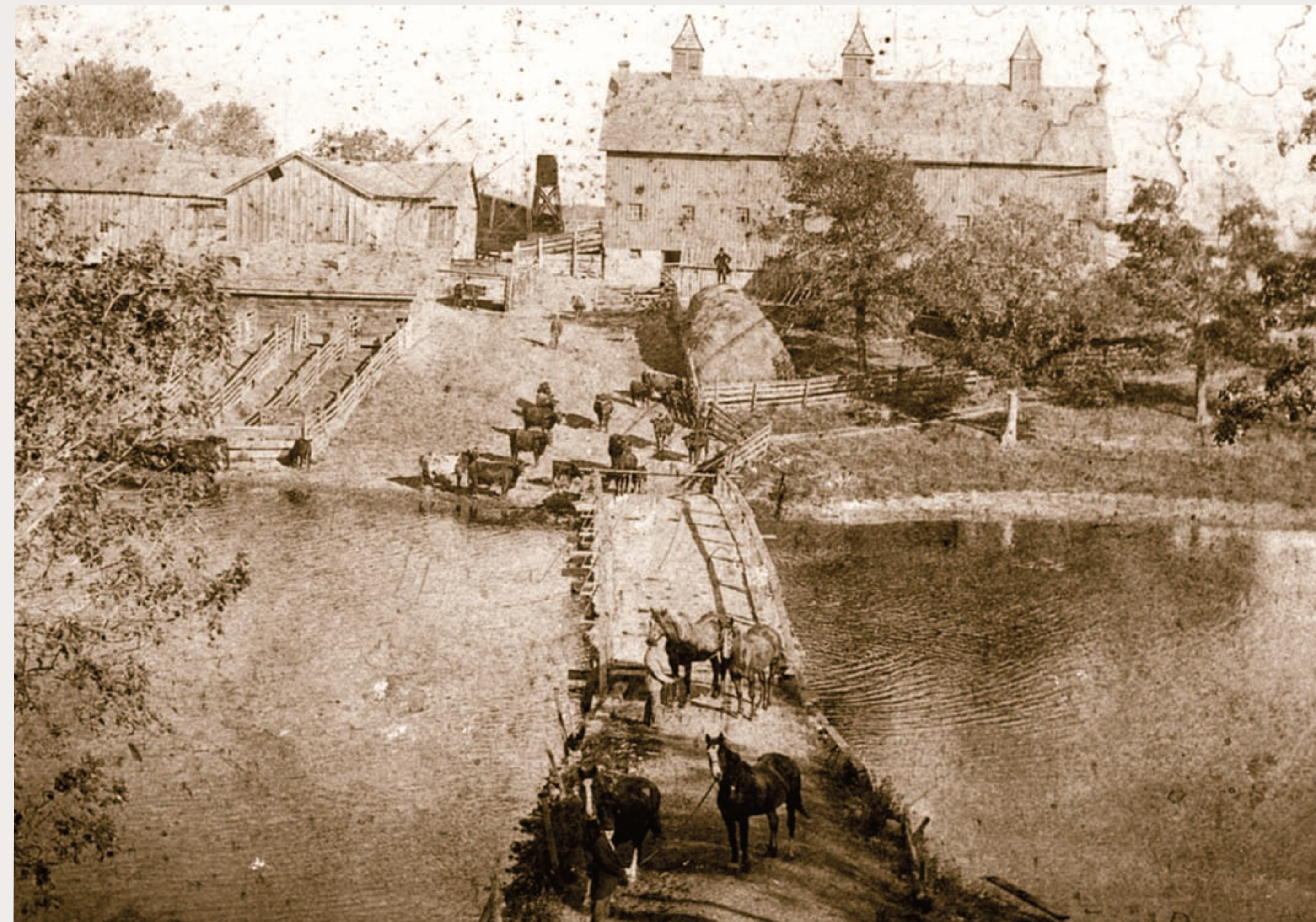
Edina Historical Society

Reminders of the Past... The millpond—today little more than a swell in the creek—was at the farm's southern edge. The mill's dam and Browndale Bridge bounded the property. A second bridge allowed passage of pedestrians and cattle over the millpond. Present-day Bridge Street reminds us of the wooden structure that once crossed here. The image above shows the view from today's Sunnyslope neighborhood looking towards the Browndale Farm.