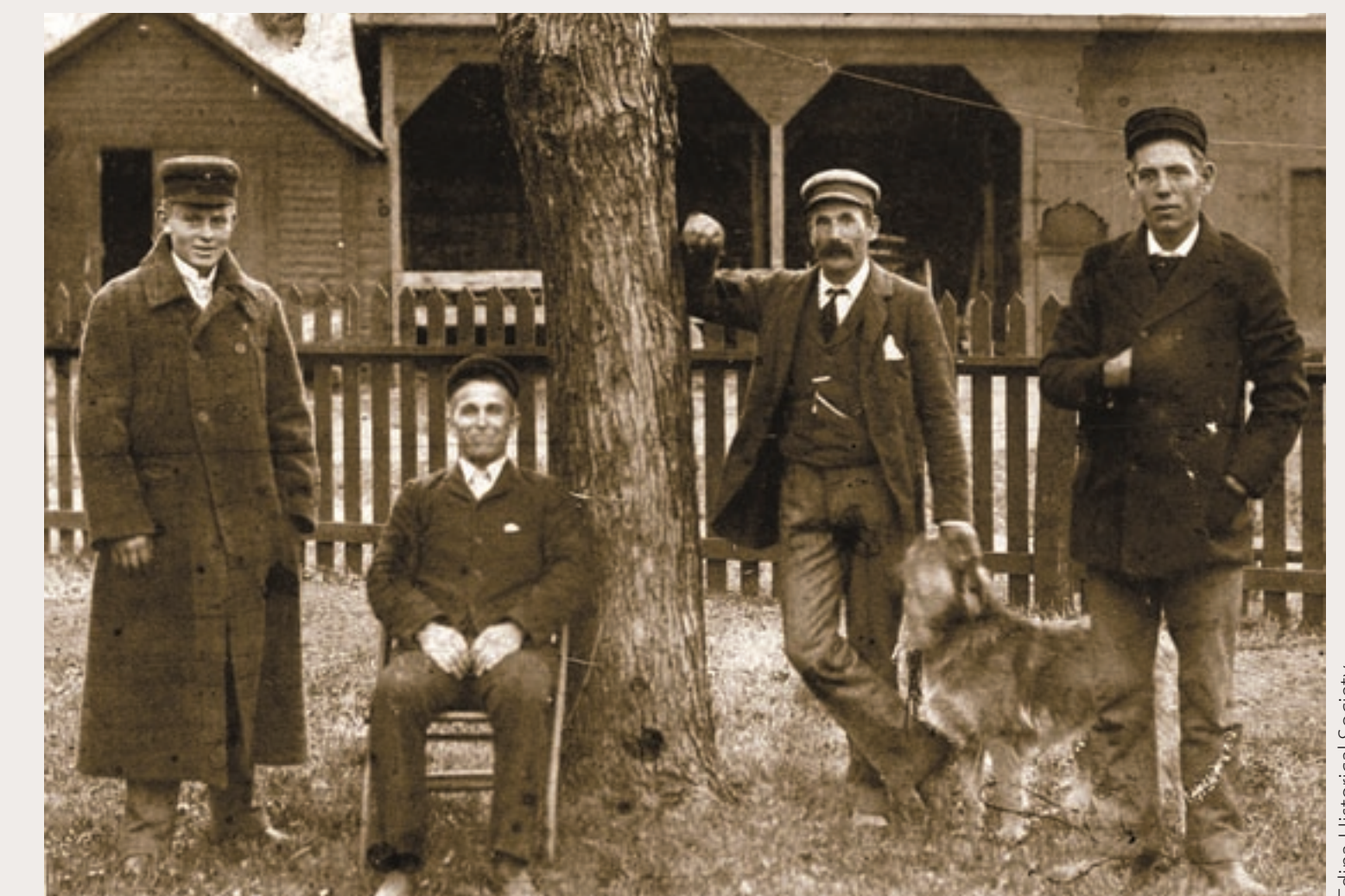
At the Browndale Farm around 1890.

Reminders of the Past... The millpond—today little more than a swell in the creek—was at the farm's southern edge. The mill's dam and Browndale Bridge bounded the property. A second bridge allowed passage of pedestrians and cattle over the millpond. Present-day Bridge Street reminds us of the wooden structure that once crossed here. The image above shows the view from today's Sunnyslope neighborhood looking towards the Browndale Farm.