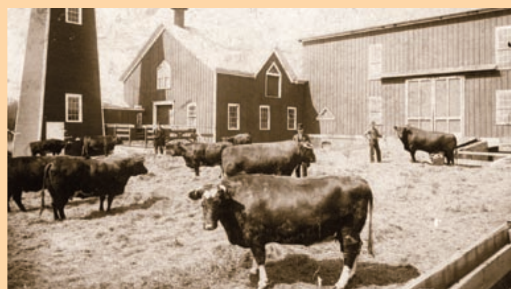
The farm's Scotch-bred Shorthorns and Jersey cattle were national prize-winners.

Visitors and dignitaries from around the region and overseas came to admire its operations. And central to the farm's success was the neighboring Edina Mill, which gave access to high-quality grains.